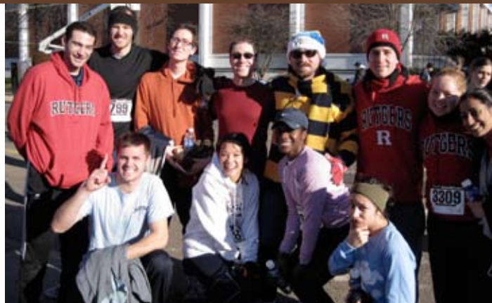
RUTGERS BIG CHILL

This year for the first time Bloustein students formed a team, the Waddling Penguins and ran in the Rutgers Big Chill 5k run. The event provides gifts for children during the holidays. It was a great event with over 4,500 participants and tons of donated toys for the kids.