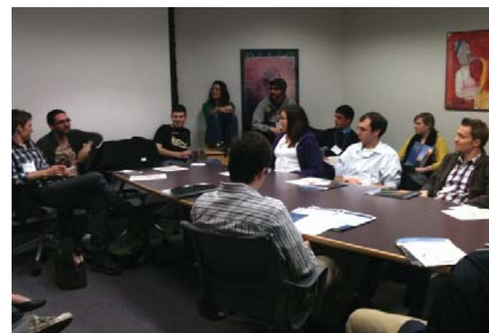
WB3 hosted an information session on biking during Admitted Student's Day.